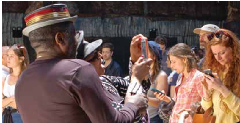
Individual and collective perspectives of A Subtlety .

“Dialogue brought forward by the work... can connect us to the larger discourse and the role that artists have to play in marking and provoking the social tensions of our time.”